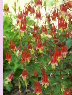
Aquilegia canadensis – Red Columbine