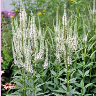
Veronicastrum virginicum -Culver's Root

Club premiums will be available for pick up at the May 28 th meeting.